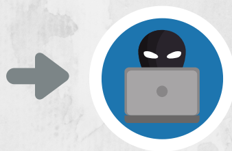
Cyb3rThi3f Professional Refunder