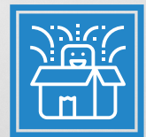
Fake TID (NEW)

"I shipped my package back. Check the tracking and weight"